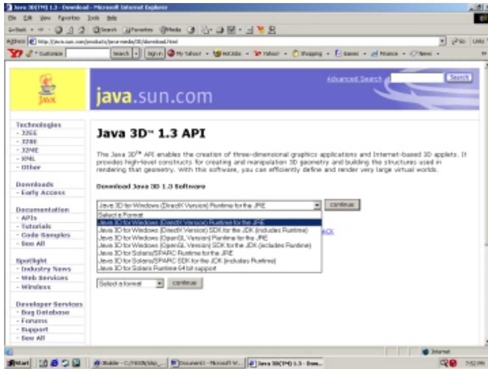
Fig. 3 Downloading Java 3D API